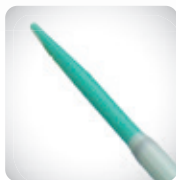
Radiopaque band available