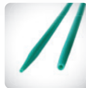
.018" dilator vs .038" dilator

GALT's Micro-Access ELITE HV™ Hemostasis Valve Introducer Kits provide the high quality expected for use during Cardiac Cath Lab and interventional procedures. They are specially designed to provide consistent performance every time.